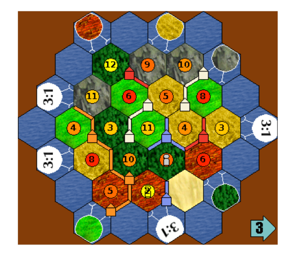
Figure 1: A game of Settlers in JSettlers.

future states non-deterministic, compelling players to assess the risk of their moves, including trading moves. A player's decisions about what resources to trade depends on what he wants to build; e.g., a road requires 1 clay and 1 wood. Trading decisions are also determined by estimates of what will most advance, or undermine, the opponents' strategies (Thomas, 2003). Players can also lose resources: e.g., a player who rolls a 7 can rob from another player. What's robbed is hidden from view, so players lack complete information about their opponents' resources. Because Settlers is a game of imperfect information, agents can, and frequently do, engage in 'futile' negotiations, which don't result in any trade. An agent that initiates a negotiation that doesn't result in a trade has in effect miscalculated the equilibrium strategies.