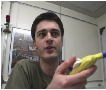
Figure 1. Still image taken from one team’s detailed design phase.