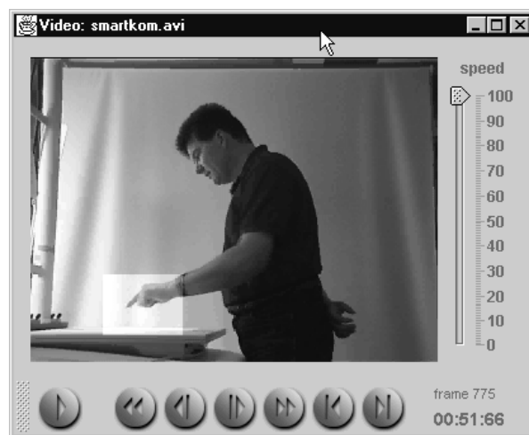
Figure 3: The video annotation plug-in

The second plug-in currently realized in Anvil is used to insert mark-up information directly into the video data. The user can link each annotation tag with a tag in the video stream (see Figure 3). A gesture’s main stroke is marked with a highlighted rectangle.