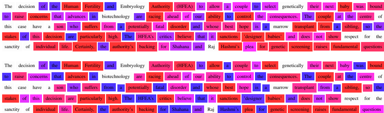
Figure 2: Top: Heatmap showing human fixation probabilities, as estimated from the ten readers in the Dundee corpus. In cases of track loss, we replaced the missing value with the corresponding reader’s overall fixation rate. Bottom: Heatmap showing fixation probabilities simulated by NEAT. Color gradient ranges from blue (low probability) to red (high probability); words without color are at the beginning or end of a sequence, or out of vocabulary.