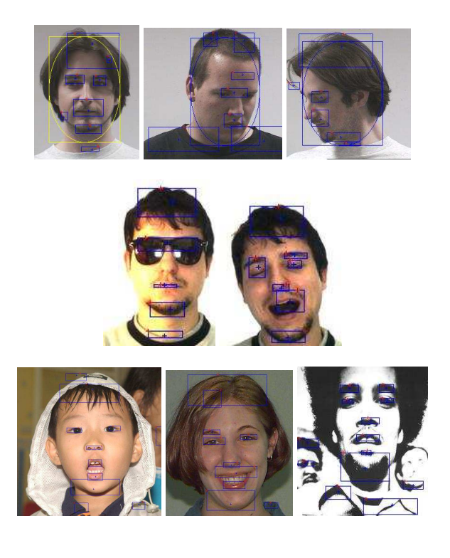
Figure 6: Examples of facial features detection [18]

Table 7: Eyes detection rate with regard to the size of the imagette in pixels