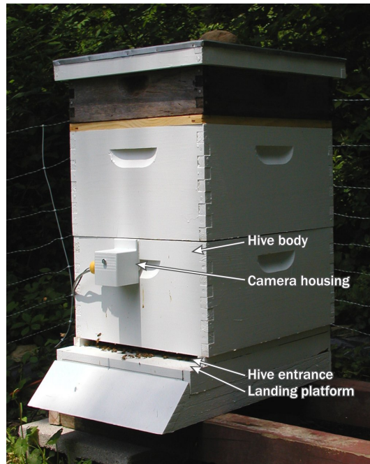
Figure 1. Instrumented bee hive

Attempts to automate activity monitoring at the hive entrance date back nearly a century [11]. Early methods are reviewed in Pham-Delégue et al. [12]. Today, commercially-available activity counters are based on infrared sensing [10, 14]. A device is placed in the hive entrance that consists of up to 32 bidirectional, bee-sized tunnels, each equipped with a dual photoreceptor to determine direction of movement. Drawbacks of this approach include obstruction of bee movement and spurious counts caused by debris in the tunnels, which must be cleaned regularly. More recent work on a capacitance-based sensor to monitor bumblebees passing through a tunnel addresses some of these drawbacks [2]. Counting systems have been developed for tracking specific bees using techniques such as metal detection [9] and bar code scanning [3, 13]. These methods require manipulation of individual bees, and