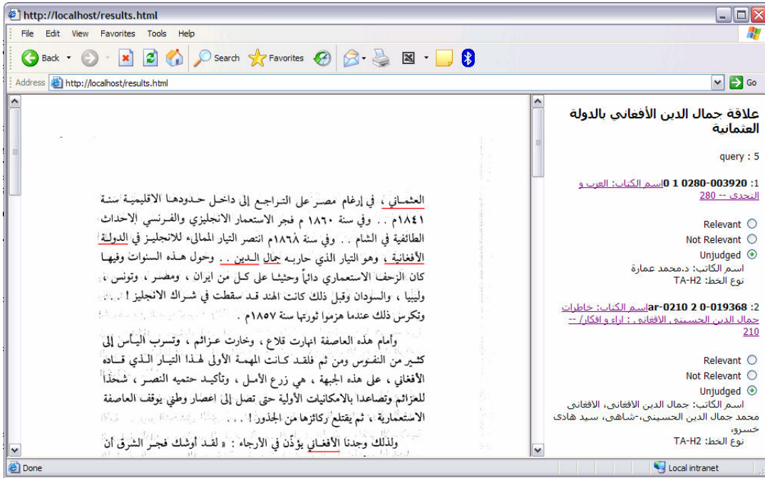
Figure 4: Web-based system for searching, displaying, and judging document images

Blind relevance feedback involves performing a search of the collection, then augmenting the user query with the m most valuable terms from the top n retrieved documents, and lastly searching using the new expanded query. In doing so, the top n retrieved documents are assumed to be relevant and the value of the terms is determined using the retrieval weighting scheme. For the experiments in this paper, the top 20 terms from the top 5 retrieved documents were used to augment the user's initial query.