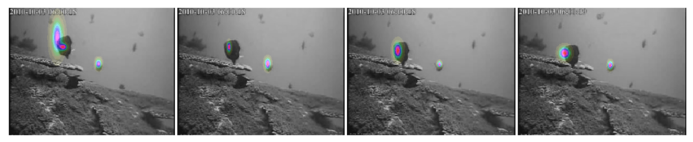
Figure 3. Heatmaps of two fish detected in an 4-frame sequence.