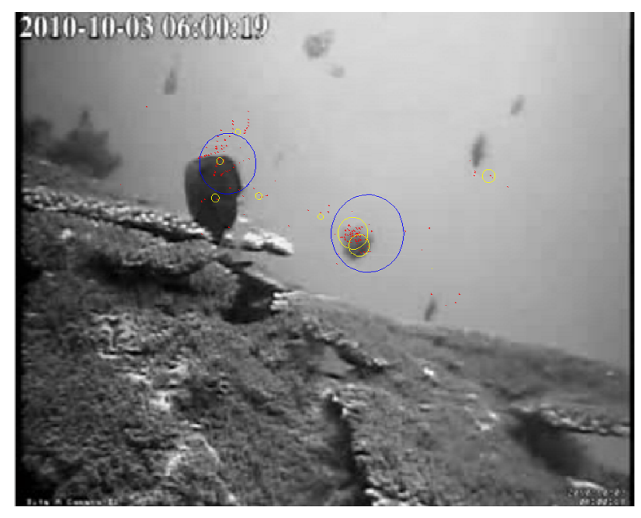
Figure 2. Clustering applied on the acquired data: Red dots are the locations clicked by the users. Yellow circles represent the result of the first clustering iteration, while the blue circles are the final result of the clustering method. The radius of each circle is equal to the sum of the quality scores of the users that made an annotation that belongs to that cluster, given by (3).

At each iteration, every cluster c is assigned a value that represents its significance, or radius, and is given by: