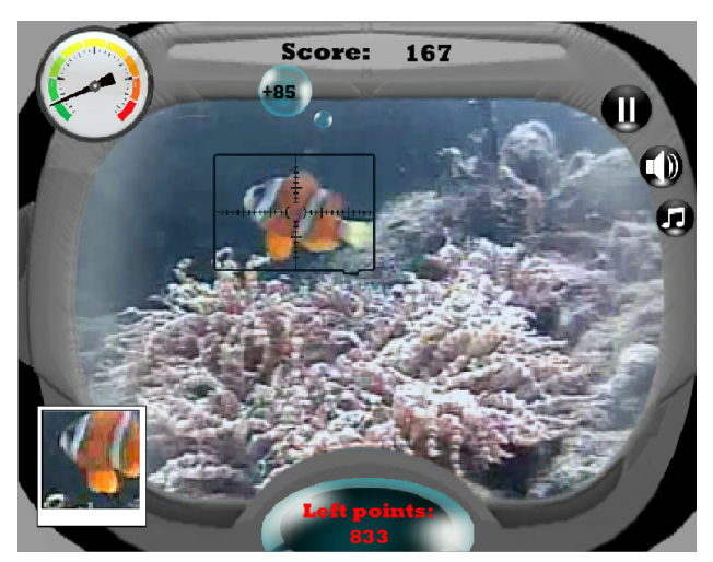
Figure 1. The game's interface. On the top left, the manometer shows the oxygen remaining (time) before the level ends. On top, the acquired points and on the top right three button controls to pause the game, mute the music and the sound effects, respectively, can be seen. On bottom left, the last took photo is shown and on bottom the points needed to advance to the next level are shown. Finally, the central area shows the video and the camera's shutter, which is centered on the mouse's pointer.

When both of these conditions are satisfied, large scale datasets can be built, but the process might be very expensive and the results often contain low quality annotations