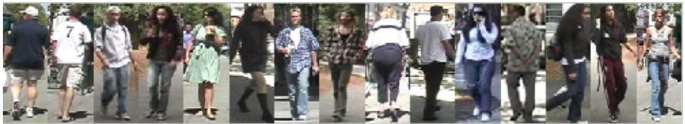
Figure 1: Example positive images for each attribute in our ontology. From left to right: shorts, sandals, backpack, open-outerwear, sunglasses, skirt, carrying-object, v-neck, stripes, gender, headphones, short-hair, long-hair, logo, jeans.

the same parameter choices for \gamma , \lambda , \theta and \sigma^2 as [19] for Gabor filter extraction, and for \tau and \sigma for Schmid extraction. Finally, we use a bin size of 16 to describe each channel.