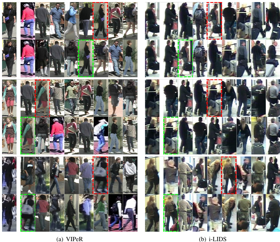
Figure 4: Examples where AIR (green) provides improvement in re-id rank vs SDALF (red).

identification [4, 6, 19] focus on high-dimensional low-level features which are assumed invariant to view and lighting. However, their simple nature and invariance also limits their discriminative power for identity. In contrast, attributes provide a low-dimensional mid-level representation which makes no invariance assumptions and can be measured reasonably reliably by a suitably trained detector. Importantly, although individual attributes vary in robustness, the combined and weighted attribute profile provides a strong discriminative cue for identity. This can complement and improve low-level feature based representations significantly. In developing a separate cue-modality and weighting strategy, our AIR is potentially complementary to most existing approaches, whether focused on features [4], or learning methods [27].