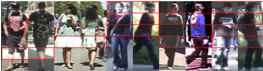
Figure 2: Strip selection results for attribute detection in VIPeR. From left to right: shorts , carrying , backpacks , logos , stripes .

Part selection As discussed in Section 2.2, we perform feature selection to choose the spatial parts (strips) used for detecting each attribute. Figure 2 illustrates the largely intuitive parts associated with some attributes. This result shows that not all features support each attribute, and that automated feature selection for spatially localised attributes is possible. Importantly, by reducing the feature space for each attribute, this also helps to alleviate the challenge of leaning from sparse data for each attribute.